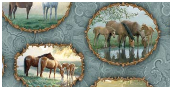
1/4 yd Paisley Horse Frame 28424