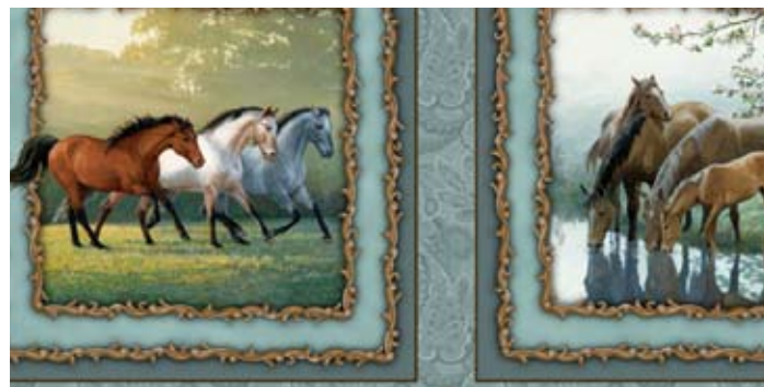
1/2 yd Pillow Panel 28735