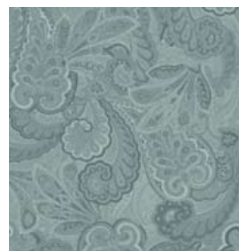
2 1/8 yds Paisley 28738

ADDITIONAL SUPPLIES & TOOLS: 1 2/3 yds Needlepunch Fleece Basic sewing supplies Sewing machine Iron and ironing surface